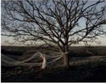
ANA SILVERA ORACLES